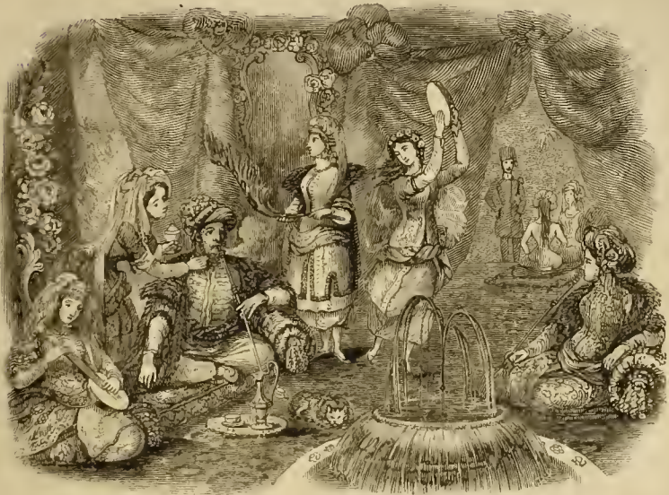
A TURKISH FAMILY PICTURE.

Author of "Sketches of Germany and the Germans," &c.